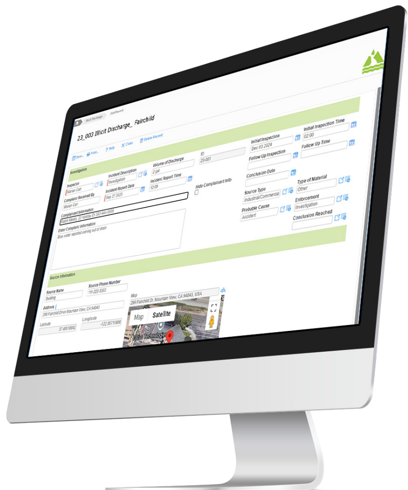
Above: Example of an Illicit Discharge Form in Locus