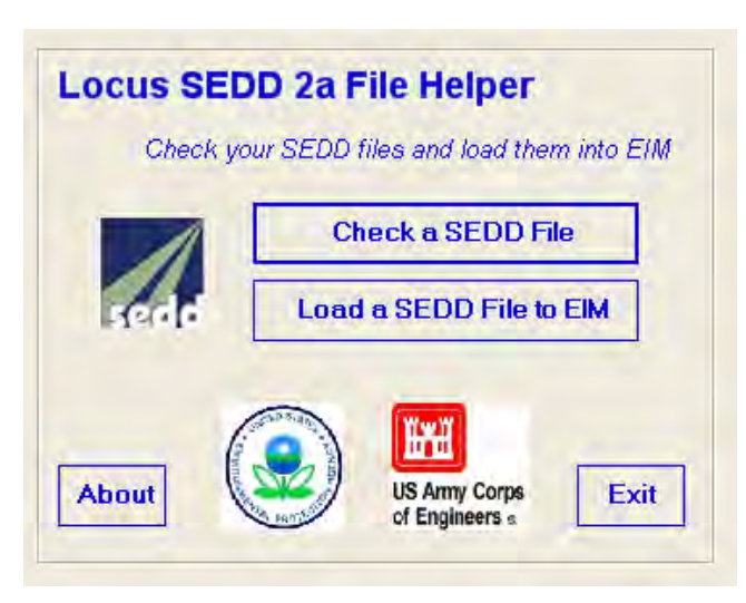
Figure 3. The Locus SEDD 2a File Helper