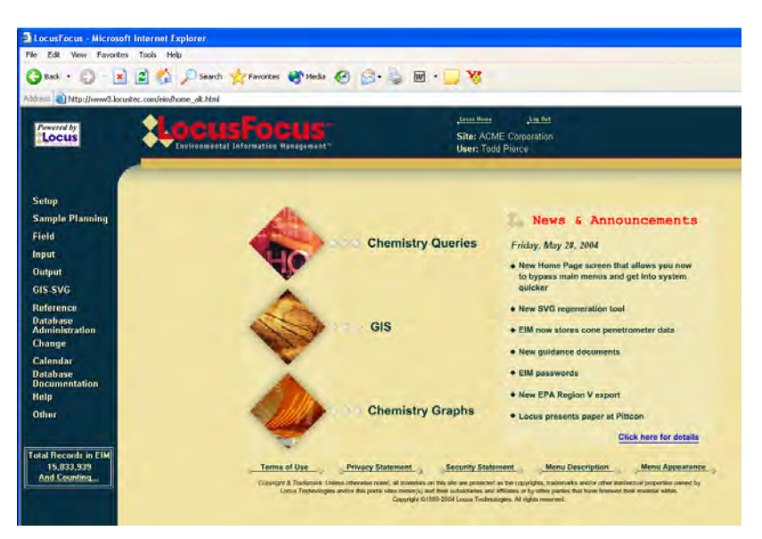
Figure 1. The EIM System from Locus

The Environmental Information Management (EIM) system is a web-based application developed by Locus Technologies that lets users manage, query and report their analytical and geotechnical data. EIM is used to manage analytical, field, survey, geologic and other environmental data for almost 4,000 sites.